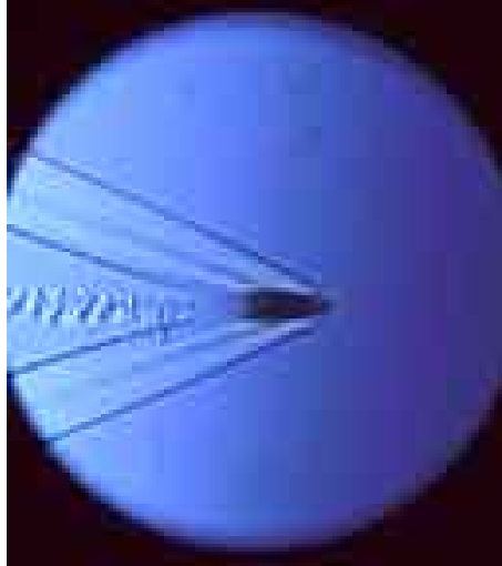
Schlieren Image – Convection Currents and Shock Waves , Steve Butcher, Alex Crouse, and Loren Winters – August, 2001.

The projectiles were 0.222 calibre bullets fired with a muzzle velocity of 1000 m/s (Mach 3). The Schlieren lighting technique used for these images makes density gradients in fluids visible. Color filtration provides false color images in which the colors provide information about density changes.